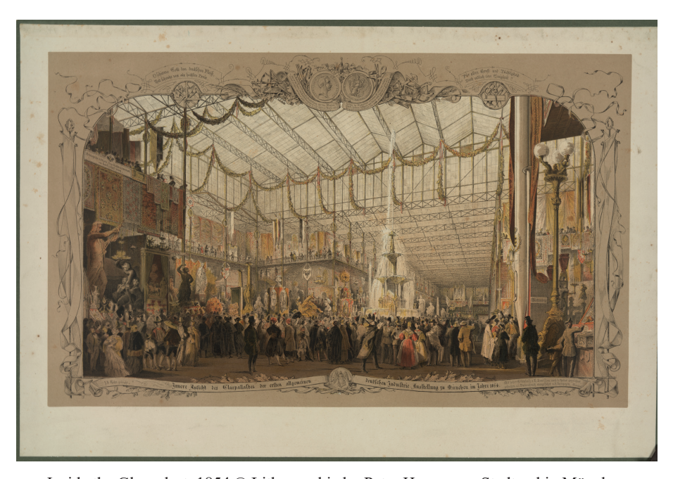
Inside the Glaspalast, 1854 © Lithographie by Peter Herwegen, Stadtarchiv München