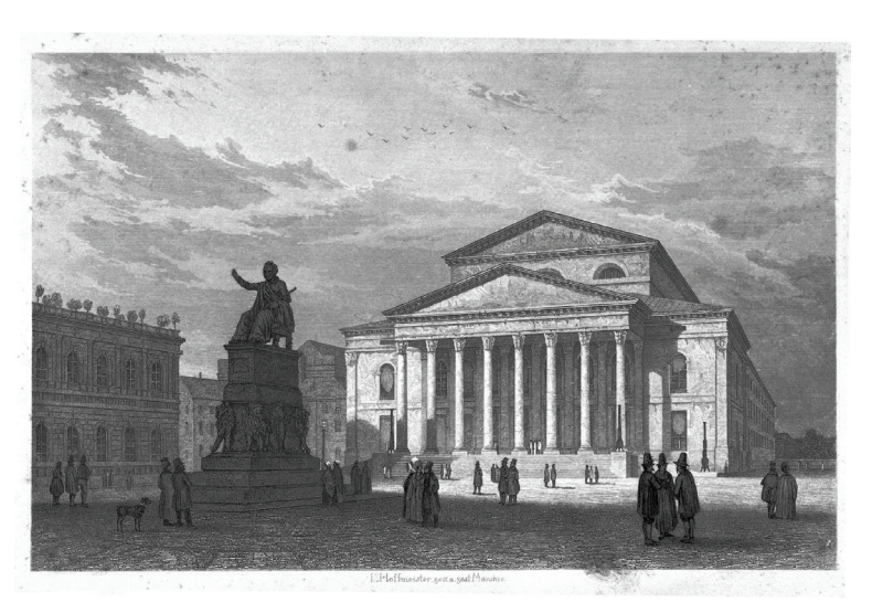
Court and National Theatre Munich, ca. 1840

and overly gentle gradient. Some of the rotten waste matter entered the soil and water table through cracks and fissures in the walls.<sup>18</sup>