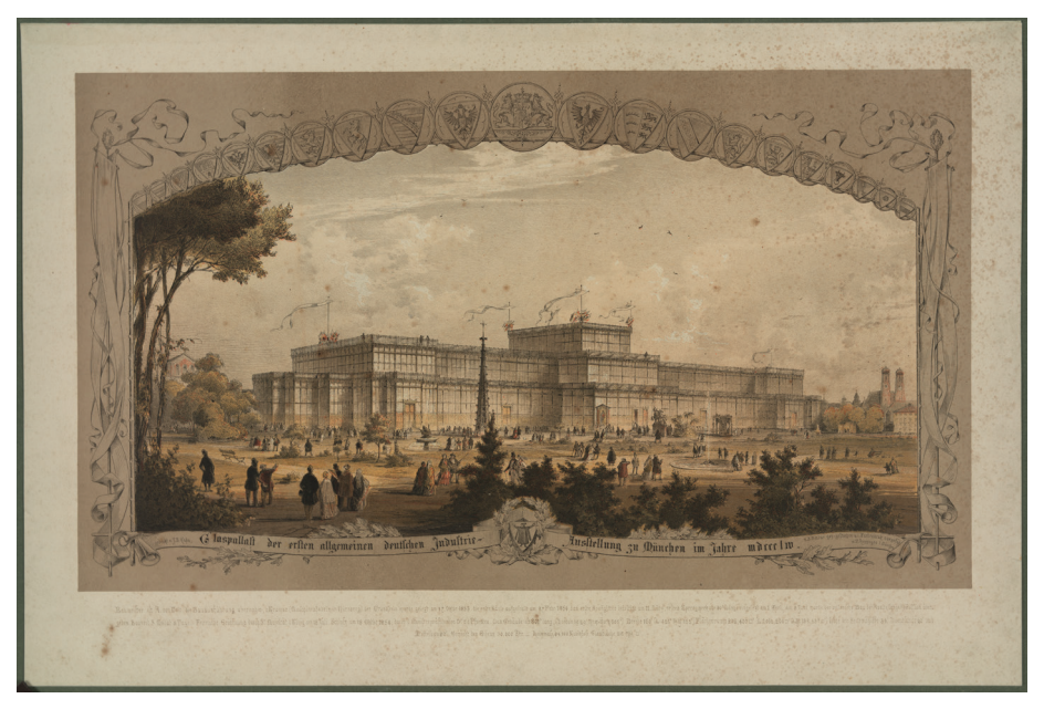
Glaspalast, 1854 © Lithographie by Peter Herwegen, Stadtarchiv München