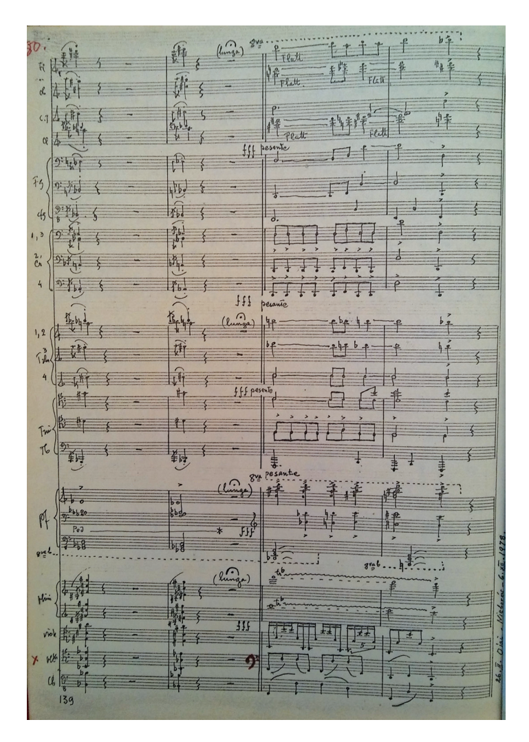
Fig. 4. Zygmunt Mycielski, Six Songs for Orchestra , ending. Zygmunt Mycielski Archive, part two, National Library, Warsaw, III 15132

the song far different from dramatic or hysterical spasms. Mycielski wrote this part of the work over the few days of his first stay at Mrs Porter's ranch. The score bears the following inscription: 'Ojai, 27 February 1978'.