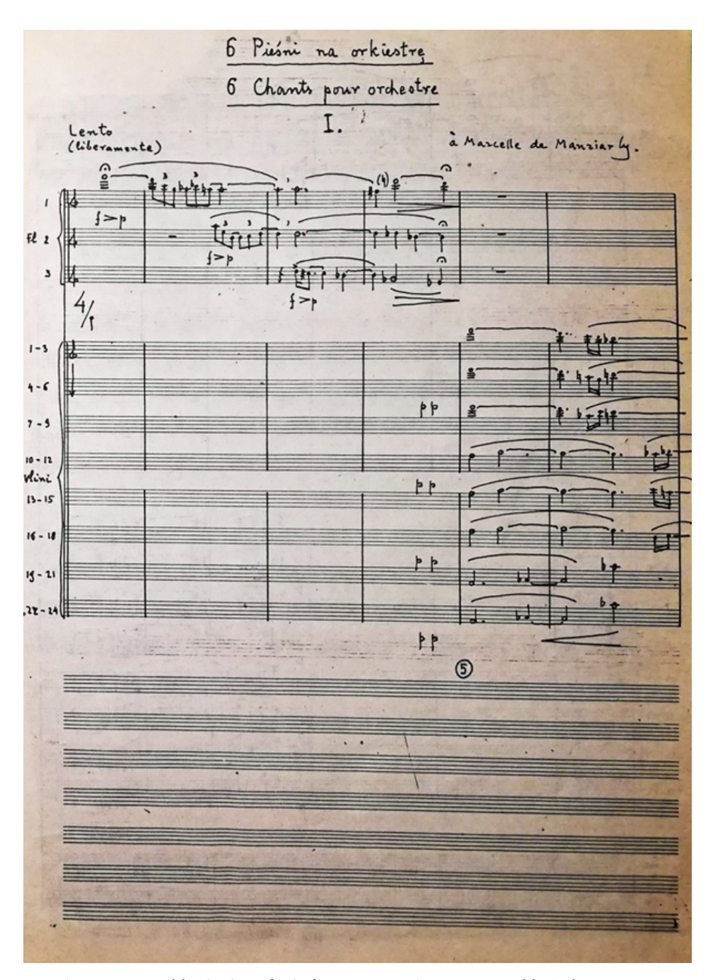
Fig. 1. Zygmunt Mycielski, Six Songs for Orchestra , opening. Zygmunt Mycielski Archive, part two, National Library, Warsaw, III 15132