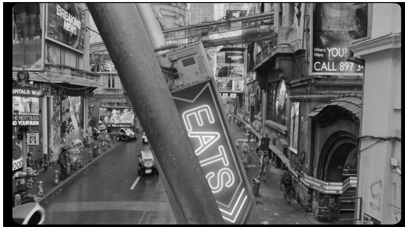
Stills from The Zero Theorem (dir. Terry Gilliam, 2013)