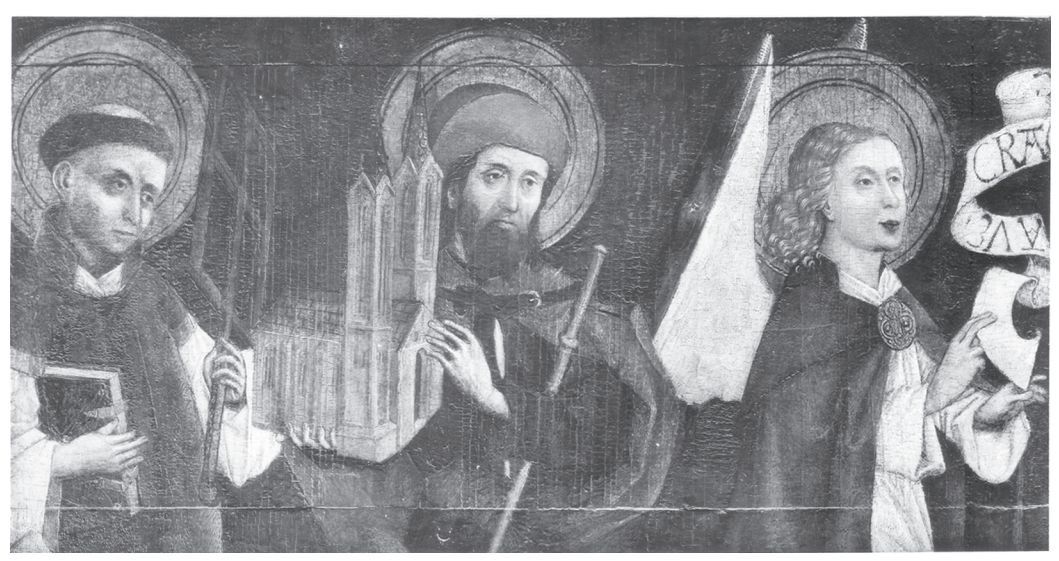
2. Panel YORAG 898a: recto and verso sides; York Art Gallery (current location unknown)

a black cloak, as if he was a Dominican friar – so in spite of the staff the identification as St Anthony<sup>3</sup> is most likely erroneous. This figure has also been identified as St Dominic<sup>4</sup>, or more recently as St Thomas Aquinas.<sup>5</sup> In fact, St Dominic seems to be the most probable option, as according to the "Golden Legend" a set of book and staff was given to that saint by St Peter and St Paul<sup>6</sup> (St Dominic's staff is still preserved as a relic in the monastery church