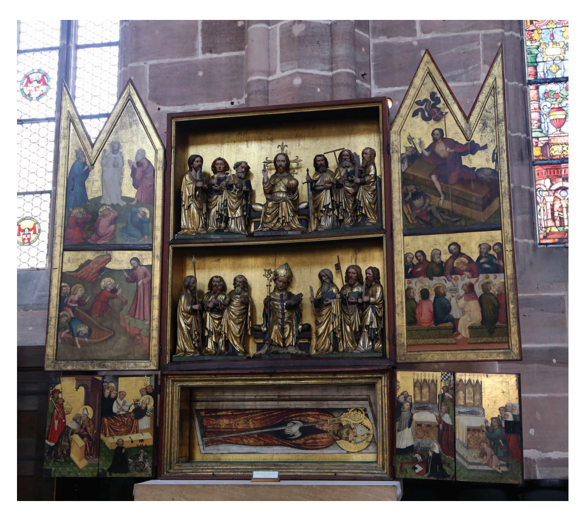
13. Deochar Altar (Deocarusaltar) in St Lawrence Church in Nuremberg, before 1437, fot. Rufus46 https://commons.wikimedia.org/wiki/File:Deocarusaltar St. Lorenz Nuernberg-1.jpg

Now let's get back to the question: is it really possible that the panels in York originally formed the predella-wings of the St Catherine of Siena retable? The panels in York indeed seem to have been wings, as they are painted on both sides. They were both painted on a support combined of small pieces of wood, which later cracked and revealed its structure. It almost looks like it was painted on some kind of wooden "left-overs", so we should rule out the possibility that the panels were initially bigger pieces (e.g. from altar-wings) later cut in the lower part. They indeed seem to have been prepared as the wings of a predella. They were both painted by the same two artists (one depicting the figures on verso and the other one on the recto sides), as their composition is very similar. However, it seems almost impossible to propose a reasonable reconstruction of their original placement in one retable structure.