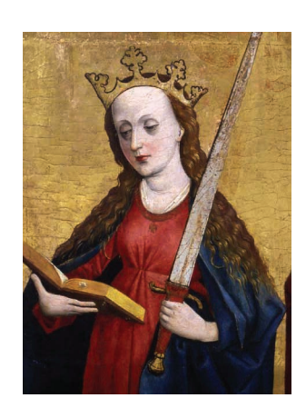
7. A comparison of the detail of panel YORAG 898b recto side with the detail of Epitaph of Count Georg von Löwenstein (ca. 1456, Germanisches Nationalmuseum in Nuremberg, Gm131, http://objektkatalog.gnm.de/objekt/Gm131).

assuming that the York panels in question were the wings of its predella.<sup>24</sup> That attribution was also accepted by the Germanisches Nationalmuseum in Nuremberg.<sup>25</sup> Meanwhile, British publications on the panels only describe the paintings as German School or Nurembergian School, with no reference to the possible connections to Hans Pleydenwurff and his workshop at all.<sup>26</sup>