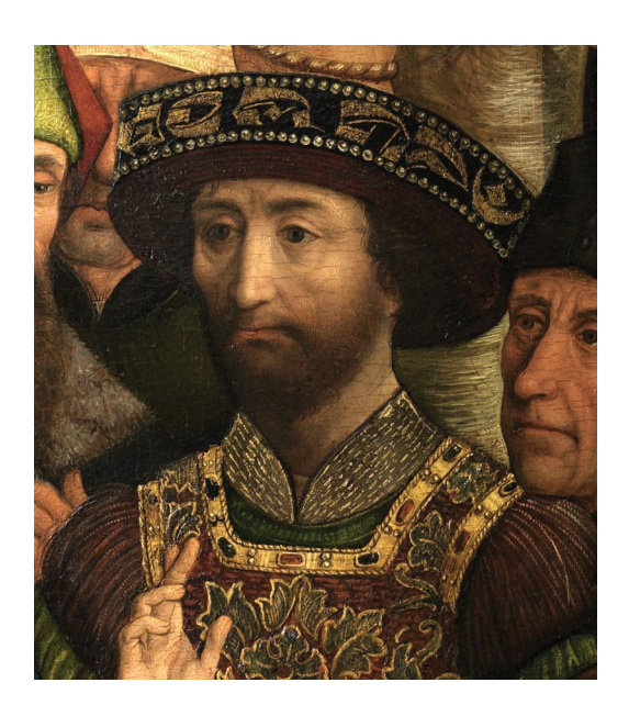
8. A comparison of the details of recto side of panel YORAG 898a and Epitaph of Count Georg von Löwenstein, ca. 1456, (Nuremberg, Germanisches Nationalmuseum, Gm131, http://objektkatalog.gnm.de/objekt/Gm131)

in the third quarter of the fifteenth century, we know very little about it – there are no records on its location or how many people were employed there. In 1462 Hans Pleyden-wurff completed the commission of the high altar for the St-Elisabeth Church in Wrocław – two panels survive from that retable<sup>28</sup> and it is actually the only documented piece of art by Hans Pleydenwurff (Fig. 6). Nevertheless, stylistic and technical analysis enable many other pieces of art to be attributed to his workshop. That workshop certainly employed many artists, as the pieces of art attributed to Pleydenwurff's atelier often show some differences and individual character of various painters, in spite of following the style of the master.<sup>29</sup> It seems very likely that Hans Pleydenwurff knew early Netherlandish art, especially the art of Rogier van der Weyden and Dirk Bouts. Although there are no written sources that would prove Pleydenwurff's trip to the Netherlands, his paintings show that he was familiar with the art of those famous masters; he introduced many Netherlandish motifs to Nuremberg art. Hans Pleydenwurff died in 1472 and his workshop was taken over by Michael Wolgemuth, who married Pleydenwurff's widow, and later was a teacher of Albrecht Dürer.