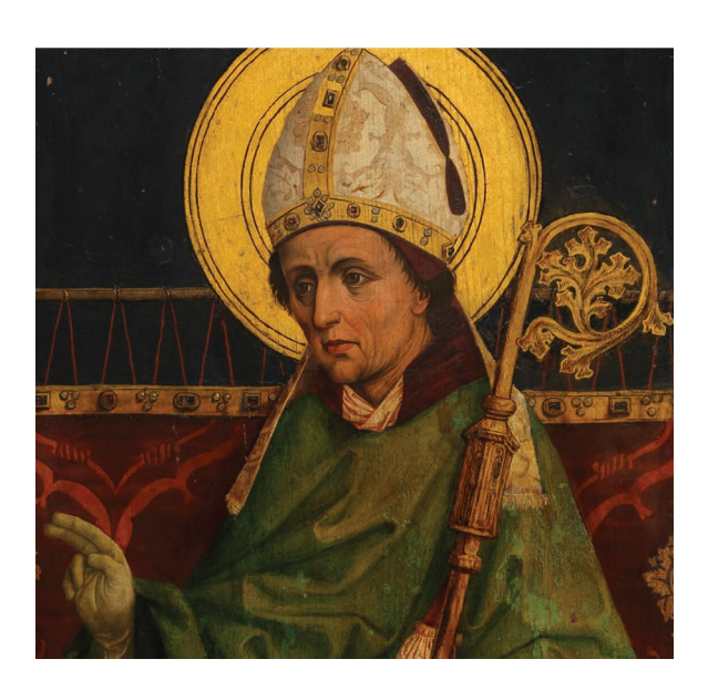
4. A comparison of the details of recto side of panel YORAG 898a (present location unknown, fig. 2) and an altar-wing from Saint Catherine of Siena Retable, 1464, Hans Pleydenwurff and workshop (Nuremberg, Germanisches Nationalmuseum, Gm140, detail of fig. 11)

at Silos). Usually in gothic art St Dominic was depicted with a lily rather than with a staff and book – those attributes became much more popular for him in baroque art. 8