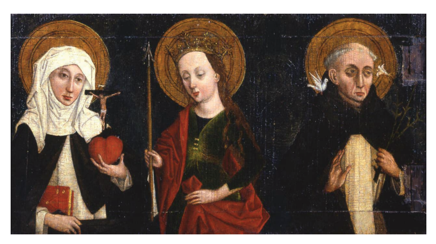
1. Panel YORAG 898b: recto and verso sides; York Art Gallery

Both panels were painted on pine-wood, both measuring 25×49.1 cm. They contain the depictions of three saints in half-length on each side. One side of each panel has a golden background, suggesting it used to be in the inner side of the altar-wings, while at the other side the saints are placed against the dark background (outer side of the altar-wings). Unfortunately, nowadays only one of these panels is still in York Art Gallery (number 898b, Fig. 1), as the other one (898a, Fig. 2) was stolen from the Gallery on 13<sup>th</sup> November 1979 and its current location remains unknown.