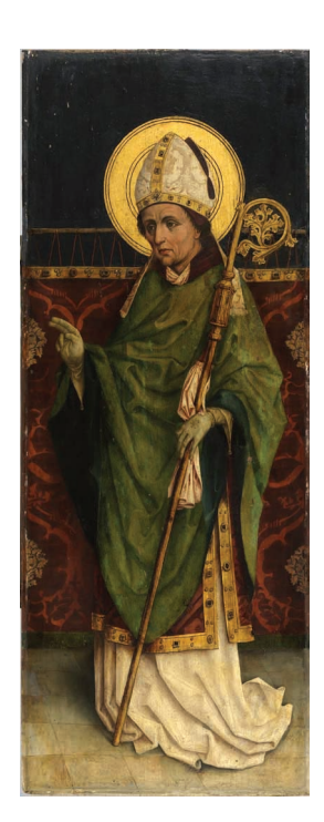
11. Hans Pleydenwurff and workshop, Saint Catherine of Siena Retable, 1464, middle opening – reconstruction, Nuremberg, Germanisches Nationalmuseum, Gm137 (http://objektkatalog.gnm.de/objekt/Gm137), Gm138 (http://objektkatalog.gnm.de/objekt/Gm138), Gm139 (http://objektkatalog.gnm.de/objekt/Gm139) and Gm140 (http://objektkatalog.gnm.de/objekt/Gm140).

In late-medieval Germany altarpieces were generally made of wood, often with sculptures in the shrine and reliefs and paintings on the wings. Before World War II it was estimated that more than 3000 Gothic altar retables were still preserved in the German Reich, yet it was only a fraction of the original inventory; on the eve of the Reformation the biggest cathedrals housed over 50 altars each. There are various theories about the origin of late-gothic winged altarpieces, but none of those theories is unanimously approved. The oldest winged sacral structures are probably from the late twelfth century: usually single figures housed in the tabernacles, consisting of baldachin with solid back wall and hinged wings. In the thirteenth century the popular items were ivory or metal small panelled diptychs, triptychs, and polyptychs with scenes in low relief that unfold for priva-