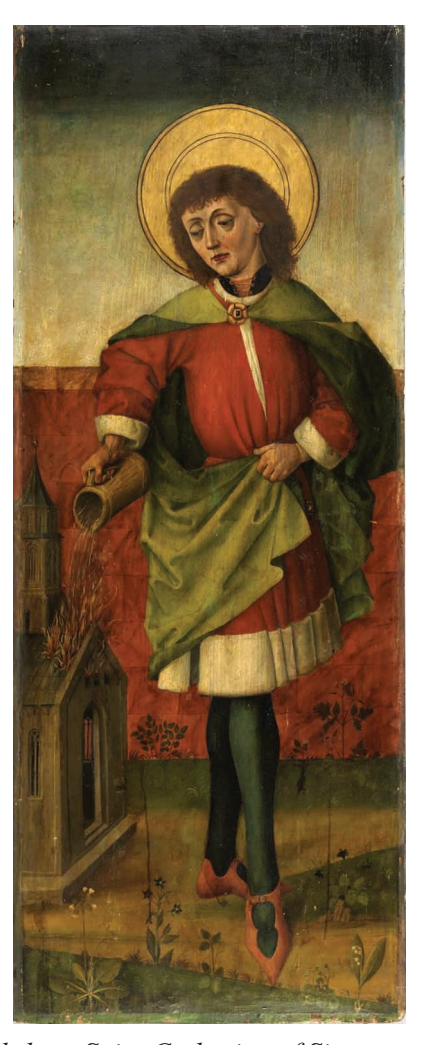
12. Hans Pleydenwurff and workshop, Saint Catherine of Siena Retable, 1464, closed – reconstruction, Nuremberg, Germanisches Nationalmuseum, Gm137 (http://objektkatalog.gnm.de/objekt/Gm137) and Gm138 (http://objektkatalog.gnm.de/objekt/Gm138).

te meditation, and some scholars have derived later altarpiece forms from those small pieces. As Perhaps the winged-altarpiece evolved from two-door reliquaries of the thirteenth century; the should be noted that the relics were exhibited on feast days on the altar, so it was natural to place the cabinet containing the relics on the altar table to present it to the public. The models for the wing-retables may have also been the sacristy cabinets with their compartments for relics and with decorated doors.