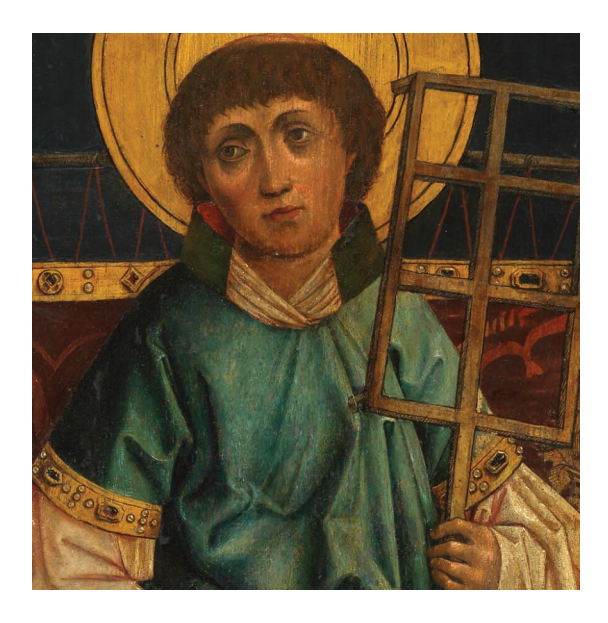
3. A comparison of the details of recto side of panel YORAG 898a (present location unknown, fig. 2) and an altar-wing from Saint Catherine of Siena Retable, 1464, Hans Pleydenwurff and workshop (Nuremberg, Germanisches Nationalmuseum, Gm139, detail of fig. 11)